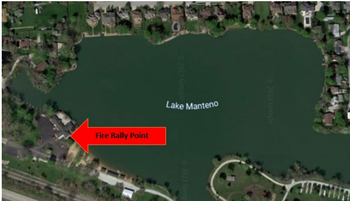
Figure 5: Fire Rally Point

Fire occurs can occur in two locations for the open water venue: on land and on the water.