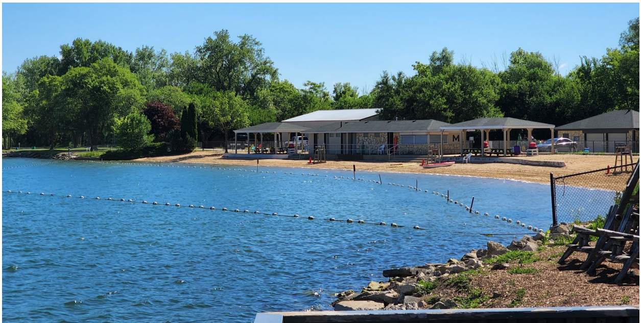
Figure 4: Lake Manteno beach access on east side of lake

The beach is located on the east side of the lake. This is where the start & finish will be for the athletes.