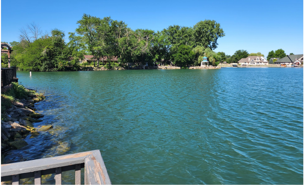
Figure 3: Lake Manteno, looking from west to south is the path to turn 1 from the start

The lighthouse is in the southend of the lake, turn 1 view.