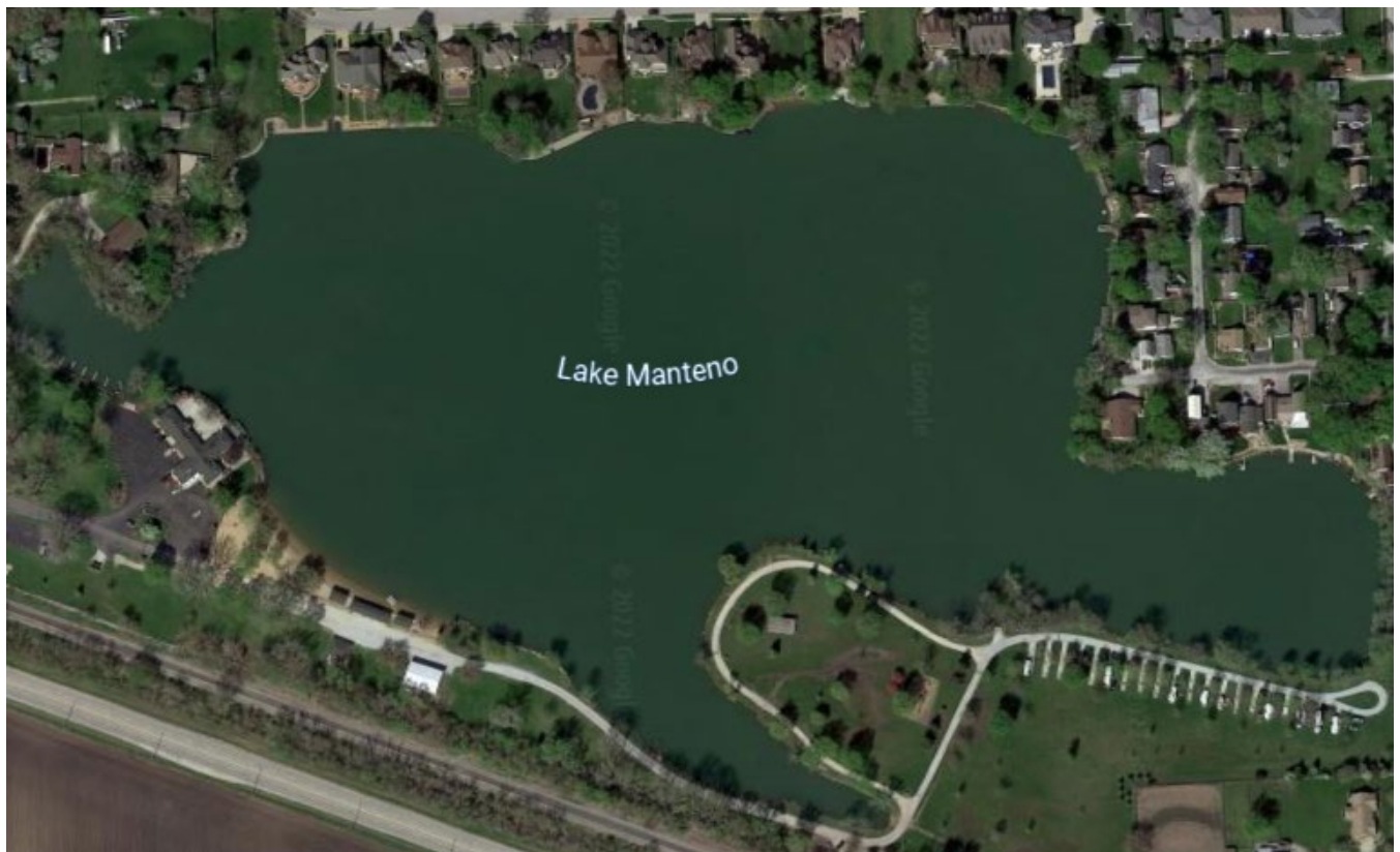
Figure 1: Google MAPS overhead view of Lake Manteno

Lake Manteno site in Manteno, IL provides a freshwater venue for performing open water swimming. The site has a private beach on the east side, private camp ground to the north, private houses to the west and the Sportsman's Club to the South. The following is the Google Maps image of the site: