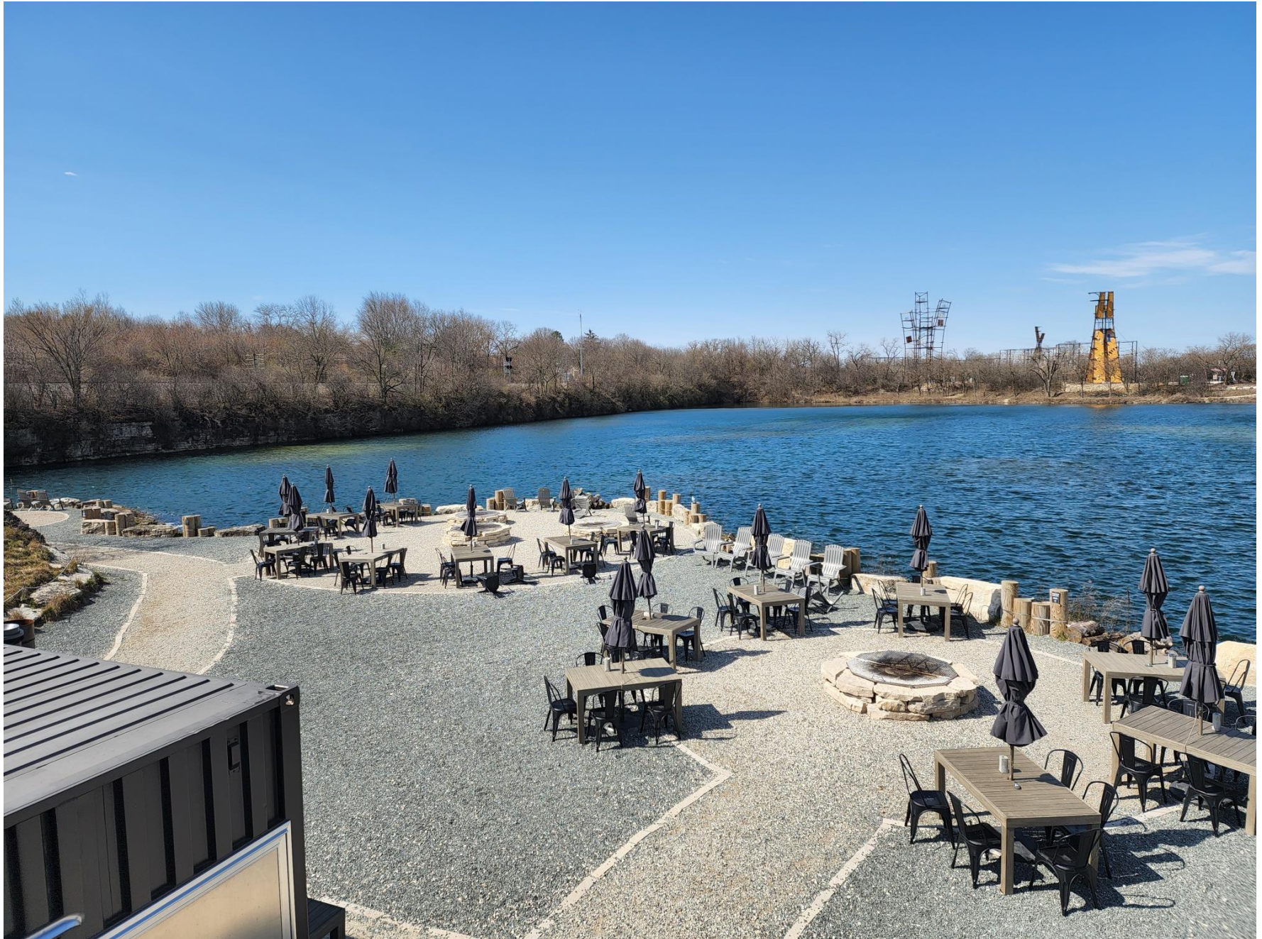
View from on top of a shipping container for parent to view race from with tables and chairs